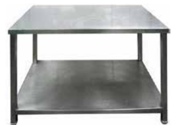
Work Table for Dry Goods