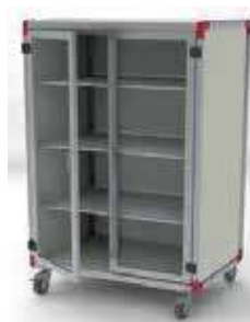
Linen Distribution and Storage Trolley