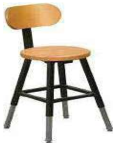
Lab Stool with Backrest