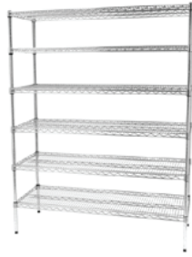
Wire Storage Shelf Module