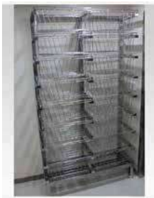
Free Standing Basket Rack