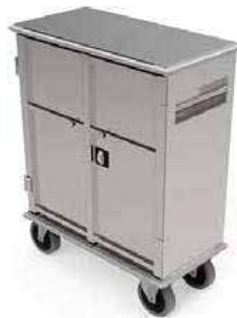
Closed Transport Trolley