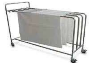
Paper Dispensing Trolley