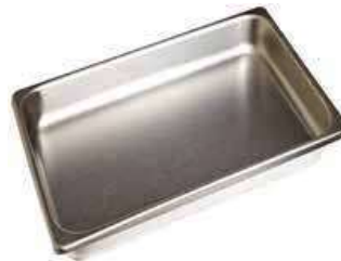
Large Instrument Tray