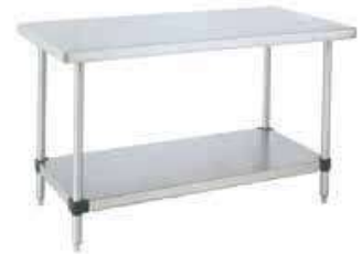
Linen Table Fold Table