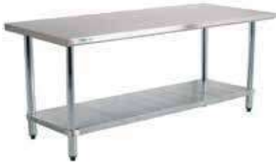
Work Table for Wet Goods