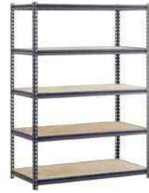
Open Storage Rack