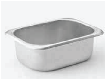
Small Instrument Tray