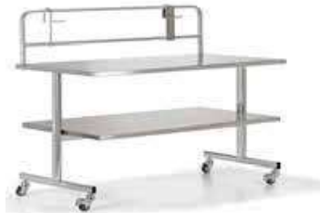
Control and Packing Table