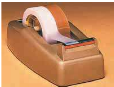
Two Roll Tape Dispenser