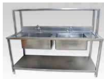
Washing Stations with 2 Sinks